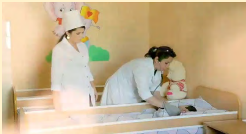
Picture 3. Daily medical monitoring of bedridden children

Among comorbidities, diseases of the nervous system (12,4%), anemia (11,9%) and coronary heart disease were noted with high rates. This is followed by diseases of the gastrointestinal tract (4,6%) and upper respiratory tract (ENT) (3,9%), endocrine diseases (1,3%). Most of these diseases occur in bedridden children, which prompts further development of rehabilitation courses for them (Pic. 3).