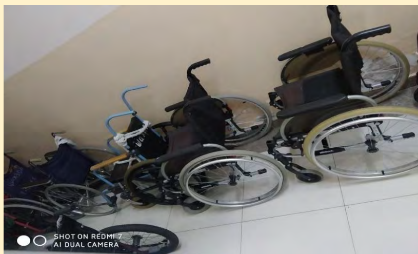
Picture 4. Wheelchairs in a boarding school

In addition, we got acquainted with the equipment intended for bedridden children in rehabilitation rooms and made sure that there are no special devices that bring the child into a vertical position in bed. It was found that nanny and nurse face several inconveniences in bed child care. Below is a picture of a wheelchair used in the boarding area. We made sure that all beds are used in prams (Pic.4).