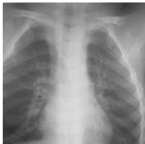
5-rasm. Mikoplazmali nevmoniya.

Ta'kidlash joizki, o'pka ultratovush tekshiruvini plevral suyuqliklar va empiemani aniqlash uchun asosiy tashxis vositasi sifatida qollaniladi [6]. Bizning tekshiruvlarimizda virusli va bakterial pnevmoniyaning farqlashda asosan klinik va laboratoriya parametrlaridan foydalanilgan.