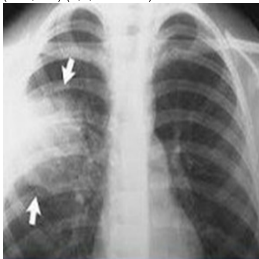
1-rasm. Pnevmonokokkli pnevmoniya.

Natijalar va muxokama. Retrospektiv tahlil natijalari kasallikning klinik kechishi bo'yicha bakterial, atipik bakterial va virusli pnevmoniyalar klinik simptomlarining (yotal, isitma, entikish) ko'pincha bir xil bo'lishini (100,0%; 86,0%; 88,0%) va shuning uchun ham turli xil etiologiyali pnevmoniyalarni ishonchli tarzda ajratib bo'lmasligini tasdiqladi ( P < 0,001 ) (1,2,3 rasmlar).