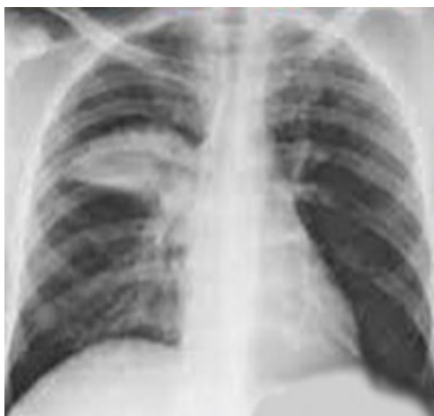
4-rasm. Stafilokokkli pnevmoniya.

Bizning tekshiruvimizda lobar va segmentar shikastlanishlar asosan bakterial etiologiyali (55,0%), interstitsial infiltratlar, peribronxial qalinlashuvlar esa asosan virusli (65,0%) va mikoplazmali (57,0%) pnevmoniyada aniqlandi ( P < 0,001-0,01 ) (4,5,6 rasmlar).