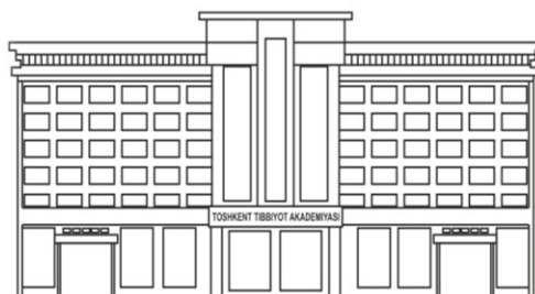
MUHARRIRIYAT VA NASHRIYOT BO'LIMI

Volume – 13,62 usl. printer. Circulation – 100. Format 60x84. 1/8. Listening means «Times New Roman». Printed in TMA editorial and publisher department. 100109. St. Farabi 2, Tel.: (998 71)214-90-64, e-mail: rio-tma@mail.ru