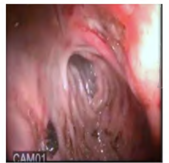
Fig. 1. Acute ulcers of the body of the stomach (the ulcer of the posterior wall is covered with a

The standard in the diagnosis of erosive and ulcerative lesions of the upper gastrointestinal tract is endoscopy. Usually, acute ulcers of small sizes 5–10 mm in diameter, the shape of the ulcers is round, the edges are smooth, the bottom is not deep, often with a hemorrhagic plaque (Fig. 1, 2). Their multiplicity is characteristic of acute ulcers, a combination of their localization in the stomach and in the duodenum is often observed.