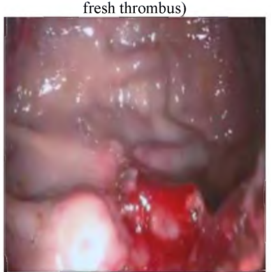
Fig. 2. Acute ulcer of large curvature of the stomach with signs of bleeding (F-I-B)

During an endoscopic examination, in addition to examining the gastroduodenal zone, a primary assessment of the intensity and nature of the bleeding is of particular importance. In order to achieve hemostasis, we used thermal (monopolar, bipolar electrocoagulation, hydrocoagulation, argon plasma coagulation), injection and mechanical (vessel clipping) hemostasis methods. The choice of hemostasis method depended on the intensity of ulcerative bleeding. With bleeding F-II-B and F-II-C, conservative therapy was performed in 155 (72.1%) patients. In 21 cases (9.7%), the edges of the ulcer were chipped, electrocoagulation was performed in 7 (3.3%), argon plasma coagulation in 12 (5.6%), and clipping in 9 (4.2%). In 11 (5.1%) cases, combined methods of endoscopic stopping of bleeding were used (Diagram. No. 1).