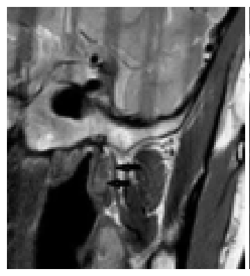
Diffuse heterogeneity of the ET cartiage (arrows) is shown in oblique parasagittal PDW image in a patient with COM

The average values of the length, thickness and volume of the CT cartilage in patients with COM were 1.37±0.03cm, 0.39±0.01cm and 0.41±0.02cm<sup>2</sup>, in the control group 1.63±0.04cm, 0.49±0.02cm and 0.7±0.05cm<sup>2</sup>, respectively. When comparing the data of both groups, a significant decrease in ETC parameters was found in patients with chronic otitis media (p<0.001).