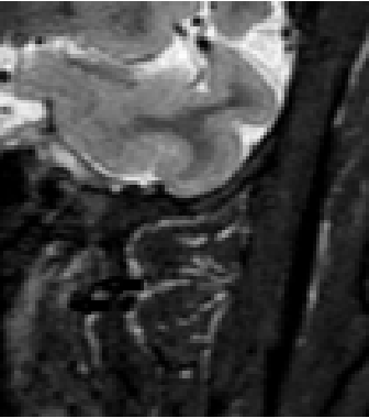
Diffuse heterogeneity, margins irregularity and reducing the size of the ET cartilage (arrows) are shown in oblique parasagittal TSFS image in a patient with COM

Conclusion: To sum up, in patients with COM, changes in the parameters of the ETC appear to be distinguishable from the healthy people, which indicates a significantly smaller size of the cartilage in patients. The high frequency of occurrence of the anatomical changes of the ETC indicates degenerative changes in the cartilage, which should also play an important role in the functioning of the tube. The revealed morphological changes of the ETC may prevent the adequate functioning of the ET, aggravating the course of the inflammatory process in the middle ear.