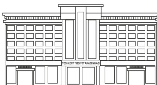
TIBBIYOT NASHRIYOTI MATBAA UYI

Hajm – 1,74 m.v. Tiraj – 20. Format 60x84. 1/16. Buyurtma № 0000-2022. «TIBBIYOT NASHRIYOTI MATBAA UYI» MChJ da chop etildi 100109. Shifokorlar ko'ch. 21, TEL: (998 71)214-90-64, e-mail: rio-tma@mail.ru № GUVOHNOMA: 7716