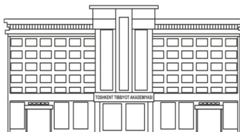
MUHARRIRIYAT VA NASHRIYOT BO'LIMI

Volume – 13,62 usl. printer. Circulation – 100. Format 60x84. 1/8. Listening means «Times New Roman». Printed in TMA editorial and publisher department. 100109. St. Farabi 2, Tel.: (998 71)214-90-64, e-mail: rio-tma@mail.ru