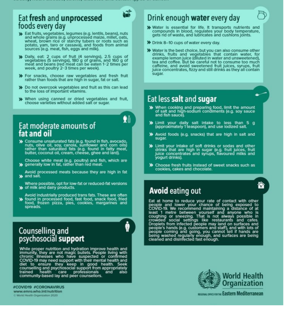
Fig. 3. Nutrition advice for adults during the COVID-19 outbreak (WHO EMRO, 2021).

Proper nutrition and hydration are vital. People who eat a well-balanced diet tend to be healthier with stronger immune systems and lower risk of chronic illnesses and infectious diseases. So you should eat a variety of fresh and unprocessed foods every day to get the vitamins, minerals, dietary fibre, protein and antioxidants your body needs. Drink enough water. Avoid sugar, fat and salt to significantly lower your risk of overweight, obesity, heart disease, stroke, diabetes and certain types of cancer.