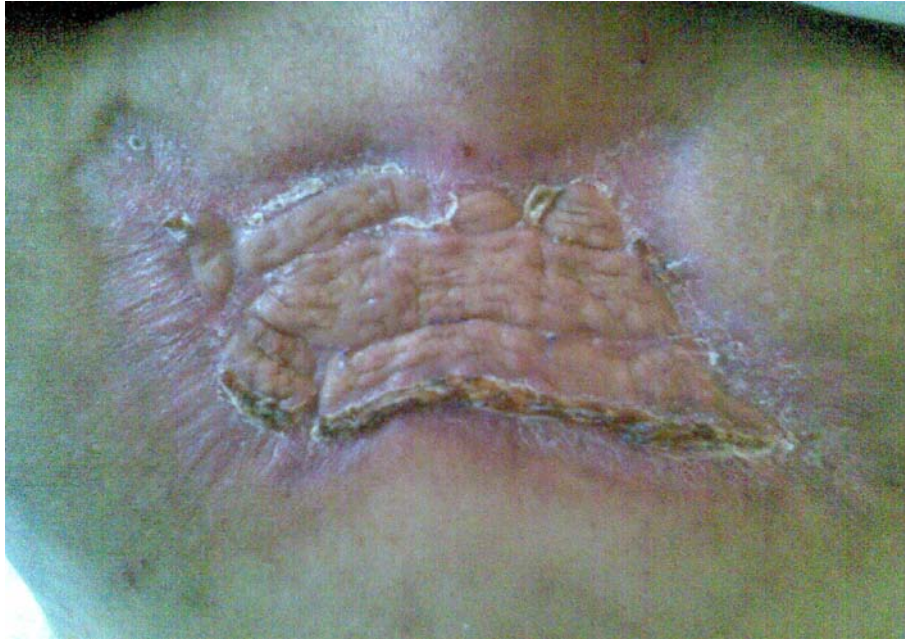
Figure 5. Appearance of autodermoplasty injury after 3 months.

This clinical situation clearly demonstrates the importance of radical, step-by-step comparative treatment of patients with soft tissue surgery. Against the background of local treatment, patients underwent intensive therapy, including antibacterial, antifungal, detoxification, immunocorrection, water-energy loss replenishment and infusion program.