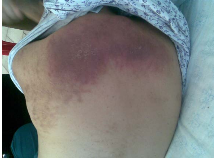
Figure1. Swelling and hyperpigmentation of the tissues of the scapula.

The patient was treated for about 10 days at the place of residence and, as noted above, the clinical sign was atypical, attributable to patients with acute surgical infection. The patient then went to the multidisciplinary clinic of Tashkent Medical Academy, where he was hospitalized for further treatment. At the time of admission to the center, the patient's condition was moderate, in consciousness, the skin was pale. Complained of pain and general weakness in the upper shoulder area. The patient was examined: Hb-98g / l, ESR - 59mm, L - 10.3 -10, total protein - 61, blood glucose - 13.8 mmol / l, AST - 0.8, ALT - 0.9, urea-8.9, creatinine - 112, bilirubin - 16. A / D - 130/80, Ps - 90 times / min, NS - 24 times per minute. The ECG shows metabolic changes. Local: the scapular area is tense, cyanotic, tumor-like swelling, moderately painful on palpation, with a sign of fluctuation, 30-25 cm ( Fig. 1 ).