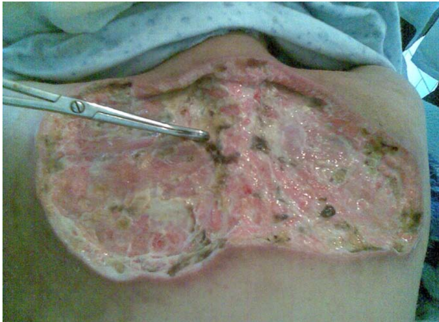
Figure 2. 3 days after surgery. Inflammatory processes with foci of necrosis continue

After preoperative preparation, the patient underwent carbuncle opening surgery under intubation anesthesia. During the surgical intervention, it was found that the pathological process is widespread with soft tissue damage in the form of a "wet sponge", which is characteristic of this type of inflammation. For this reason, the patient underwent necrectomy in healthy tissue ( Fig. 2 ).