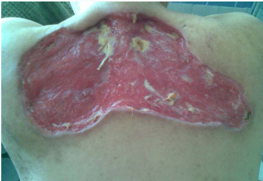
Figure 4. Dynamic follow-up after 1 month. The wound is covered with a glossy granulation in the form of winged epithelium.

On repeated examinations (in 1 month) during treatment with FarGALS, general granulation is noted with the appearance of focal rejected necrosis and marginal epithelialization ( Fig. 4 ). The patient is transferred to oily programs (sea buckthorn oil) and in 2 months the patient was again hospitalized for autodermoplasty.