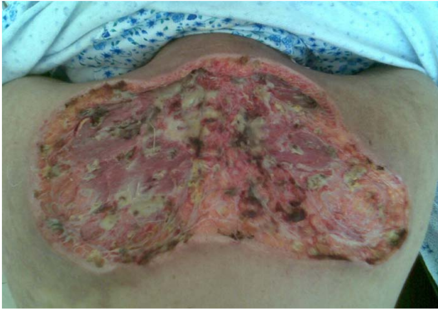
Figure 3. Manifestation of granulation with a distinct decrease in perifocal inflammatory processes.

In the dynamics, necrosis and inflammation was preserved in the background of wound healing, and for this reason on the third day the local medication FarGALS was used in a two-stage form. This allowed to achieve the appearance of focal losid granulation with a sharp decrease in perifocal inflammatory events ( Fig. 3 ).