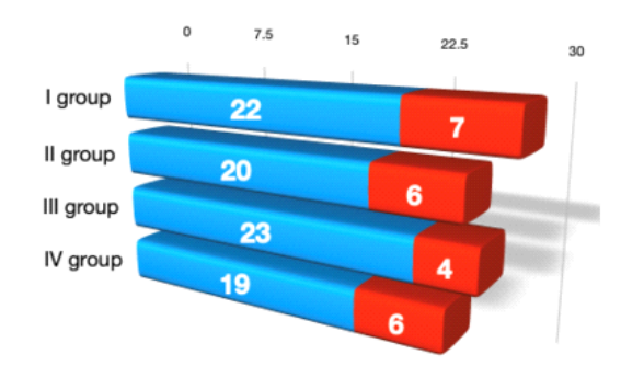
Fig.1. Distribution of patients in groups by a clinical form of abscesses

respectively), the 6th segment of the right and left lungs (17 and 12 patients, respectively). The distribution of patients by clinical forms of abscesses is presented in figure 1.