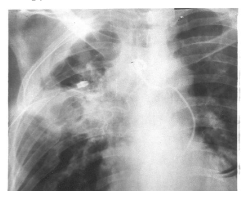
Figure 2. Bronchial arteriography of a patient before prolonged intraarterial catheter therapy

branes are pale with cyanotic tint. Tachypnea up to 25 times per minute. Pulse rate 120 beats per minute. An Xray image shows non-homogeneous darkening of the right lung with areas of lucidity, mainly in the upper lobe. The auscultatory examination revealed a mass of variously scattered moist rales in the upper right lung against the background of sharply impaired vesicular breathing, no breathing is heard in the lower lung. The diagnosis stated: "Disseminated purulent destruction (abscessed pneumonia) of the right lung. Sepsis. State after the COVID-19". Fibrobronchoscopy report: catarrhal endobronchitis on the right side of the patient. A catheter of the tracheobronchial tree was installed. On November 07, 2021, catheterization of the right bronchial artery was performed (Fig. 2) with prolonged intraarterial catheter therapy.